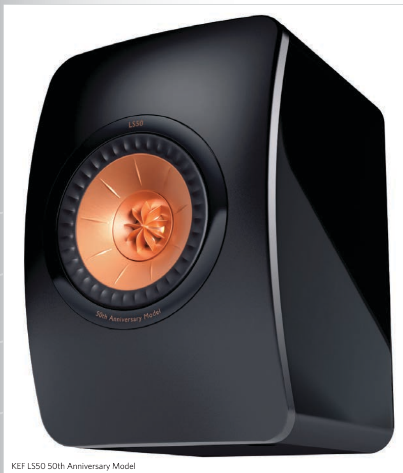
KEF LS50 50th Anniversary Model

A marvelous speaker, indeed—and a downright bargain.